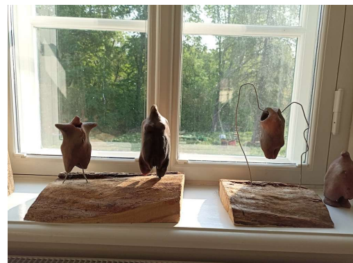
installed figures for the exhibition taking place in the Manor of Brinckenpedvale on the 26th of May 2023