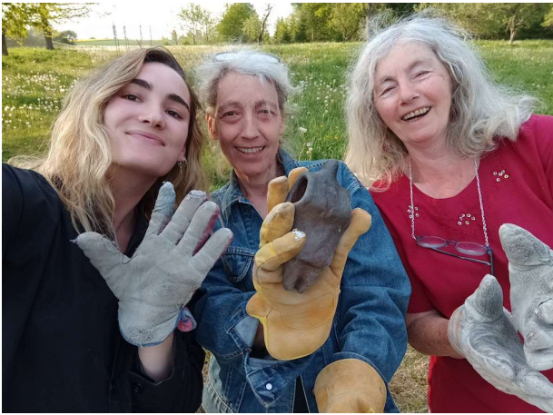
proved... the figures were thoroughly fired!