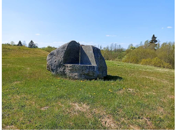
granite sculpture by Ojars Feldbergs

In the early 1990s the artist Ojars Feldbergs started to develop the Pedvale Sculpture Park after the liberation of Latvia from the Sowjet Union.