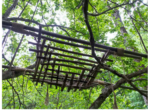
the basket became a landart piece in the woods of Pedvale Art Park