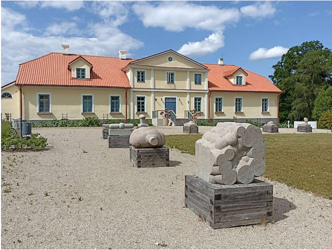
Manor of Brinckenpedvale