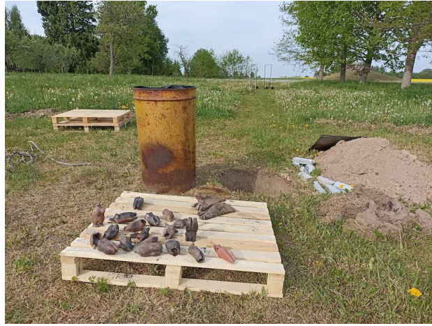
after 55 hours...