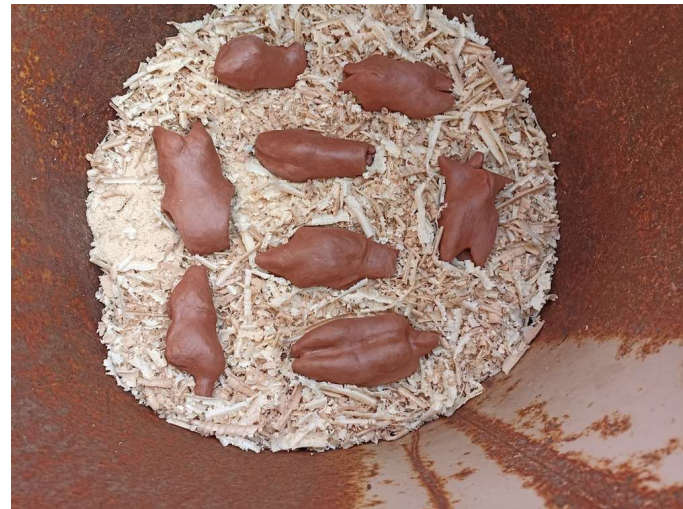
27 figures, placed in layers in between the sawdust in the barrel