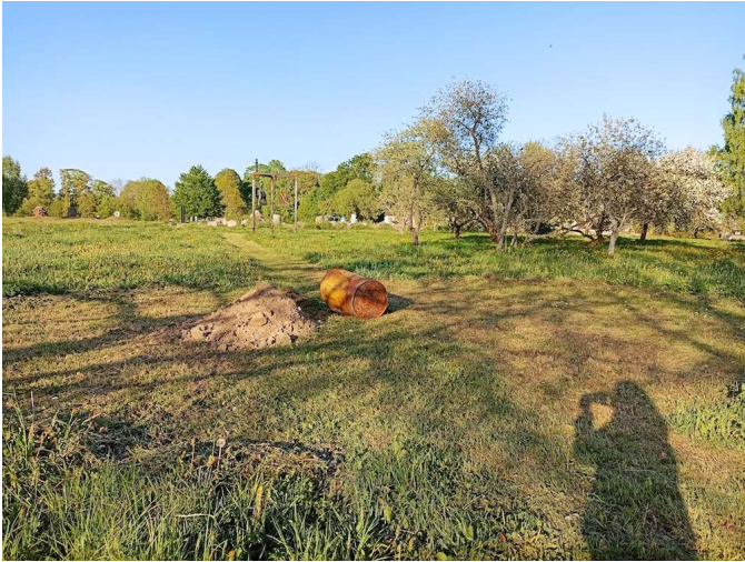
the evening before....