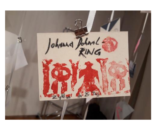
Cycle 7/2009, 25th day, ballot paper, cork stamp

My contribution to the collective installation were three stamp prints which derived from a cycle of wine corks which I did in 2009. Inspired by the term "fertility figurine" I based my work on the monthly cycle and made use of the inner calendar by forming a new clay figure on each day of the cycle. The idea is to transpose the concept of archaic fertility figurines into today's time. The installations are an expression of the deeply rooted ambivalence of the woman's place in society. The cycles were made until 2011 as long as I could rely on the inner calender.